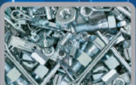
Components and Hardware