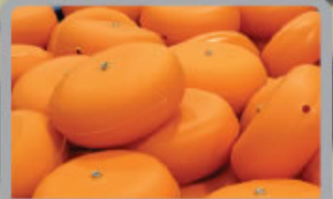
Bulk Material Storage