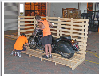
5. The motorbike is secured to the crate floor.