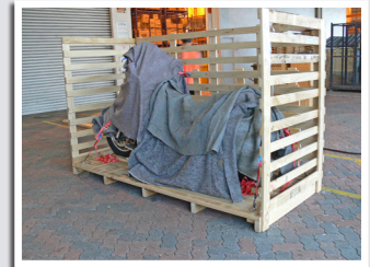
9. More protective blankets are placed over the motorbike.