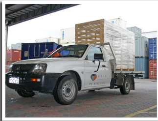
1. The custom built timber crate arrives in the packing yard.

Axis Packaging custom built a timber crate for the international transportation of a motorbike.