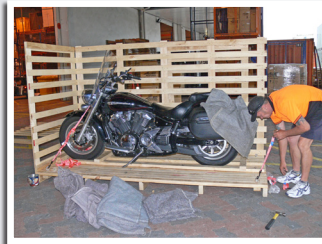
8. Blankets are used to protect the bike as it is strapped to the crate floor.