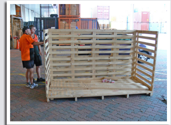
3. The crate is designed for quick disassembly for easy loading of the motorbike.