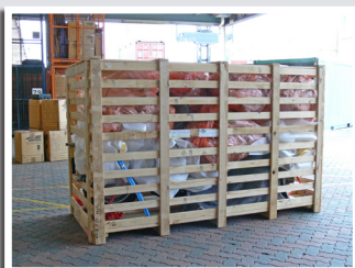
10. The crate sides are reassembled and bags of packing are added for further protection.