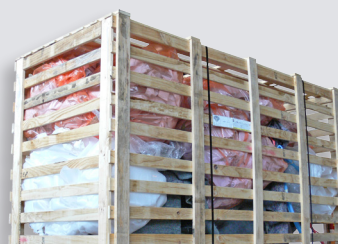
12. Ready for transportation!