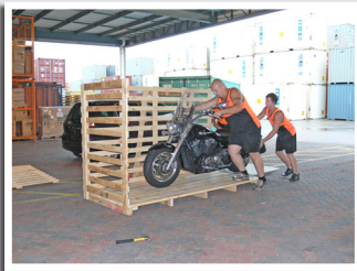
4. The motorbike is loaded into the crate.