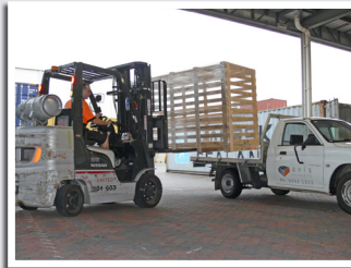
2. The crate is forklifted off the vehicle bed.