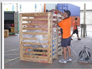
11. The lid is attached then the crate is strengthened with metal strapping.