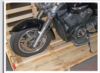
6. Dunnage is used to prevent forward movement of the motorbike.